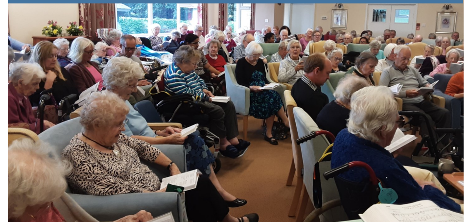
Staff, residents, family & friends worshipping together